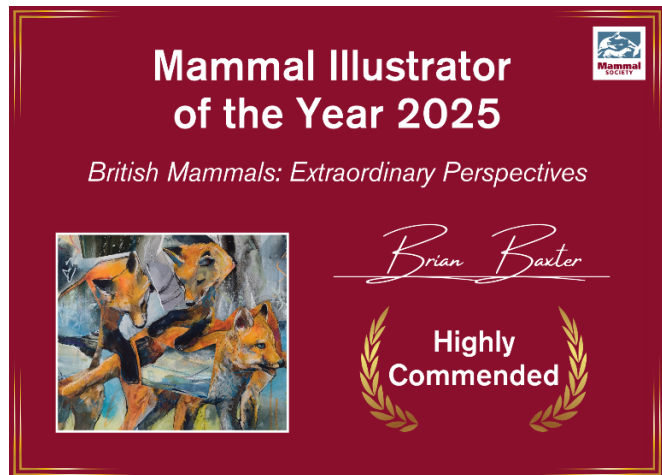
Fox Cubs , watercolour collage

Brian is showing at The Plight of the Curlew exhibition at