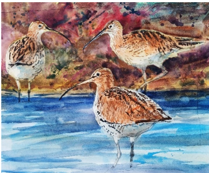
Wading Curlews , watercolour