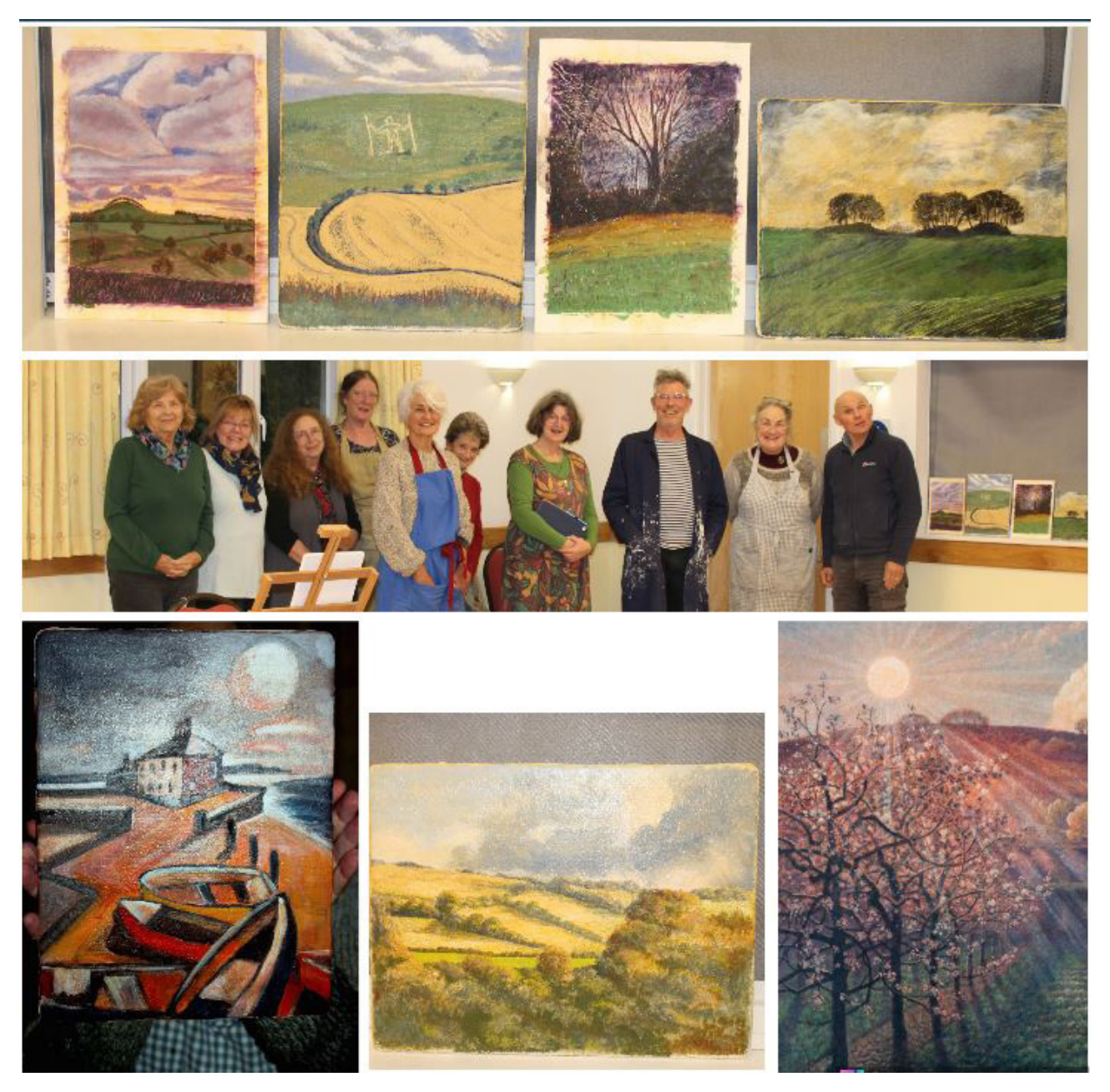
'Egg Tempera' workshop