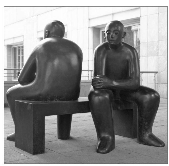
Two Men on a Bench

"It is a coincidence that Worthing Museum and Art Gallery recently asked me if I would like to hold another One Man exhibition. When I had my first exhibition there in 1996 I was interviewed on TV and asked "If being more recognised would lead to complacency?" my answer was, "ask me that when I am 65." "It is quite a coincidence that 30 years later and nearly 65, I can say that there is no room for complacency as there are still so many ideas and work to get done."