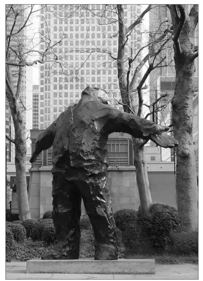
Man with Arms Open

Giles continues "I was asked to take part in 'The Shape of the Century' exhibition which started out in the grounds of Salisbury Cathedral, then went to Canary Wharf, the two sculptures I exhibited were 'Man with Arms Open' and Two Men on a Bench', both of which were bought by Canary Wharf as part of their permanent collection."