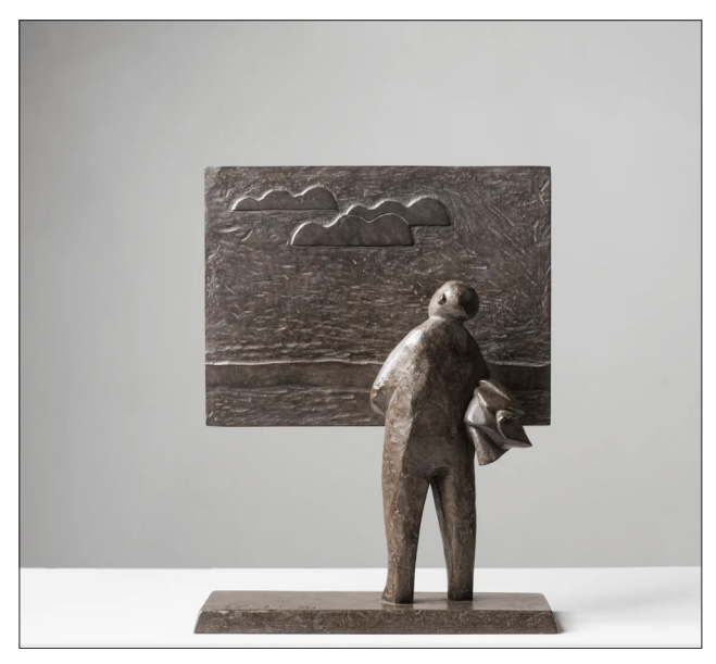
Man in a Gallery lll