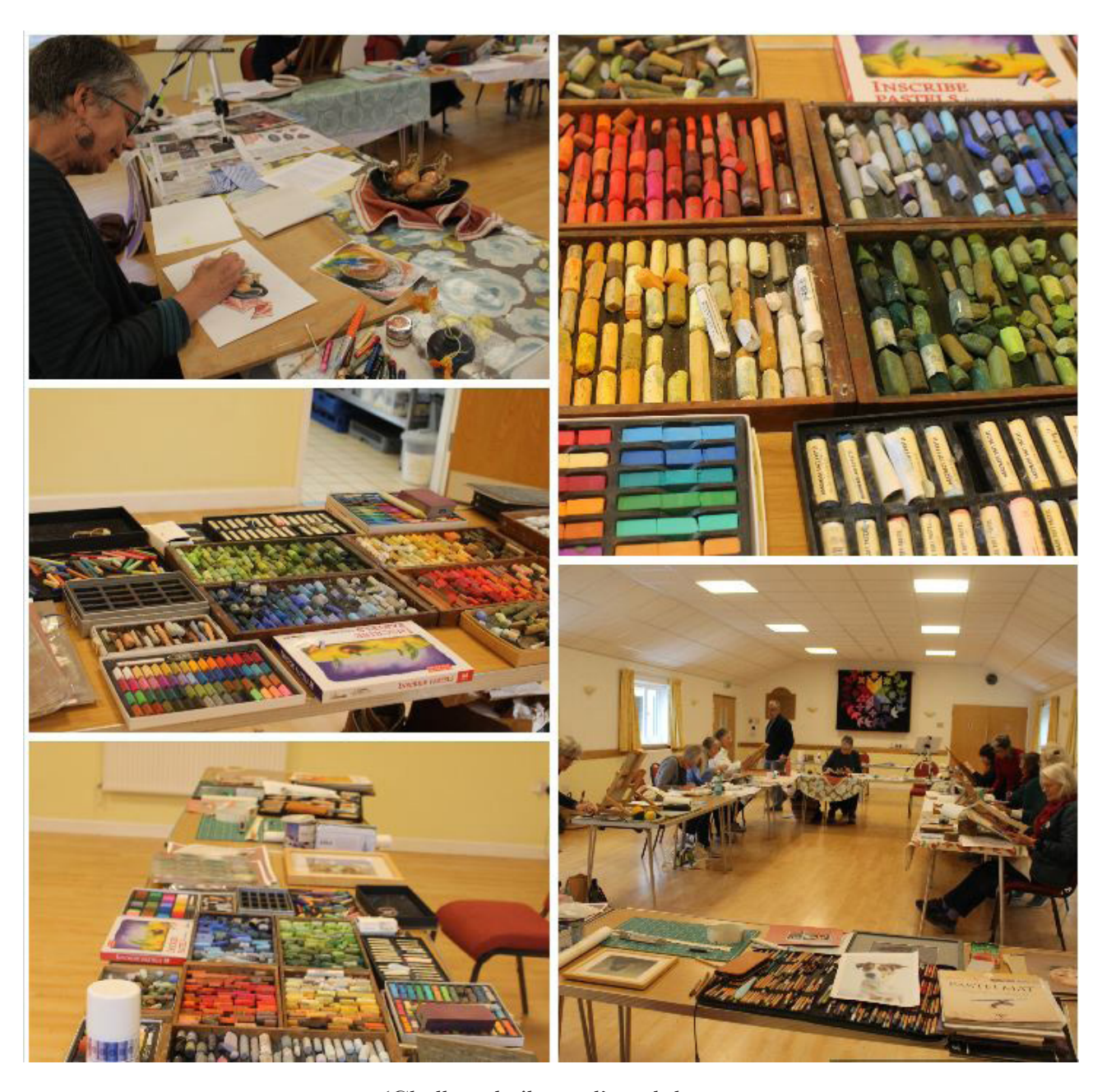
'Chalk and oil pastel' workshop