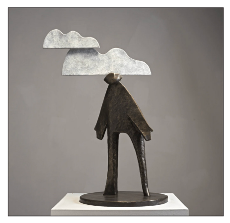
Man with Head in the Clouds